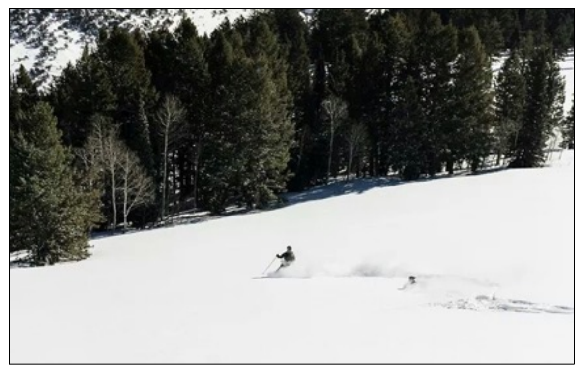
Bodhi and I skiing